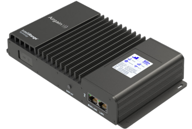
AirgainConnect® MegaFi 2

AirgainConnect® MegaFi 2 is an integrated high power 5G HPUE multi-port router and Wi-Fi hotspot device that operates on all AT&T bands. It is the first device that combines 5G support with HPUE performance – 6x the power of regular devices. With this power, MegaFi 2 provides FirstNet users and enterprises with reliable broadband connectivity, even in the most challenging environments. MegaFi 2 extends the range of user devices into remote areas and deep inside structures where standard signals won't reach. The device features a graphical display for monitoring performance and system status.