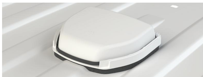
AC-Fleet™ mounting foam fits to any roof line