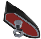
Bolt Mount with Adhesive Pad

The MULTIMAX FV 2-in-1 antenna builds on the best in class RF performance, leading design features, and extended operational life of our highly successful Fleet and Public Safety Antenna products. This new product line also offers a rugged low-profile design which gives you greater protection against all the natural hazards a vehicle faces including vibration, hot, cold, ice, salt, dirt, car washes, and tree branch sweeps. Our antennas typically outlast the life of a vehicle.